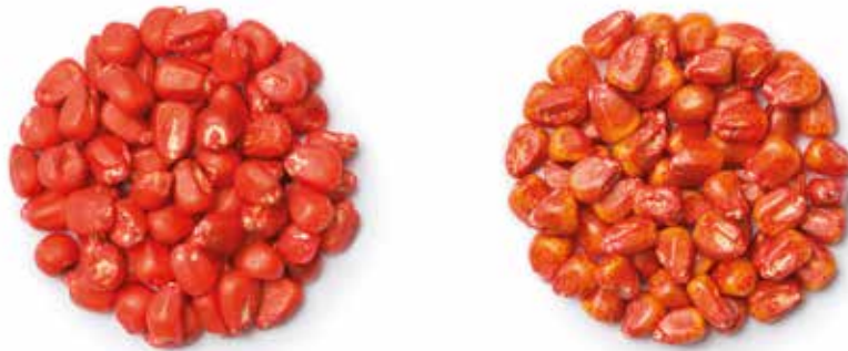
Disco AG Red L-450 + Maxim/Cruiser before and after abrasion